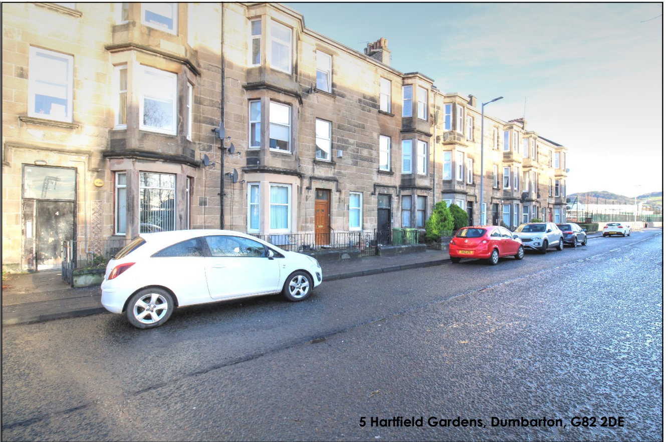
5 Hartfield Gardens, Dumbarton, G82 2DE

This one bedroom MAIN DOOR flat forms part of a traditional tenement block in a very popular residential area and is extremely convenient for Dumbarton Central train station, the town centre and St James retail park.